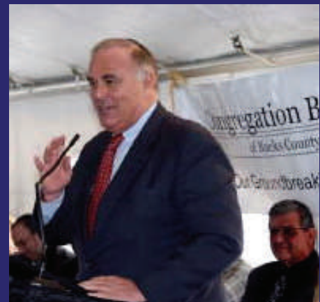
Governor Ed Rendell